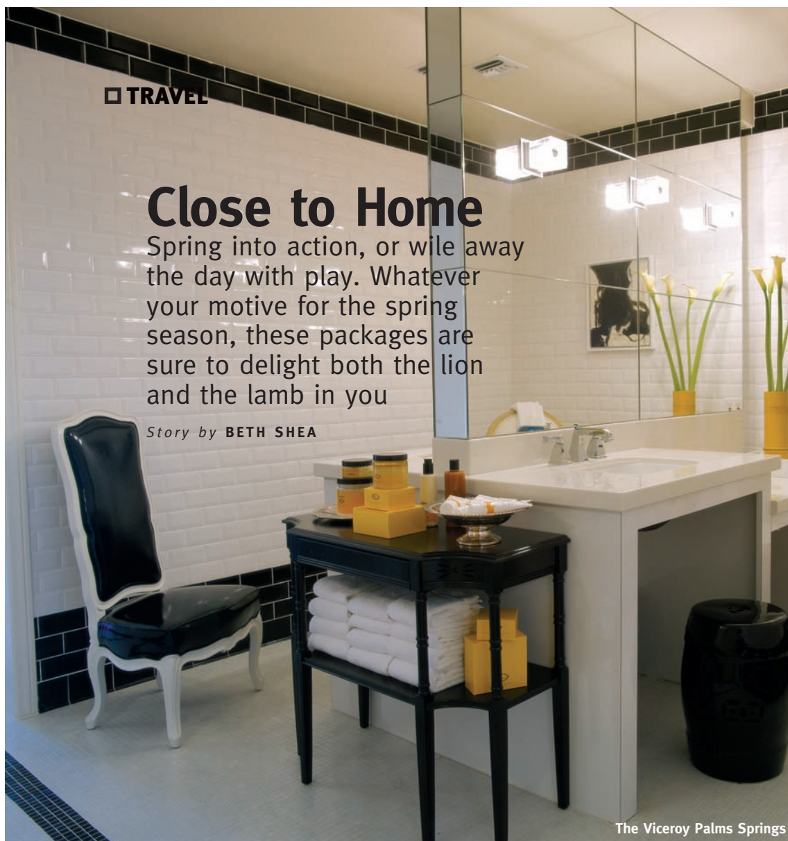
The Viceroy Palms Springs